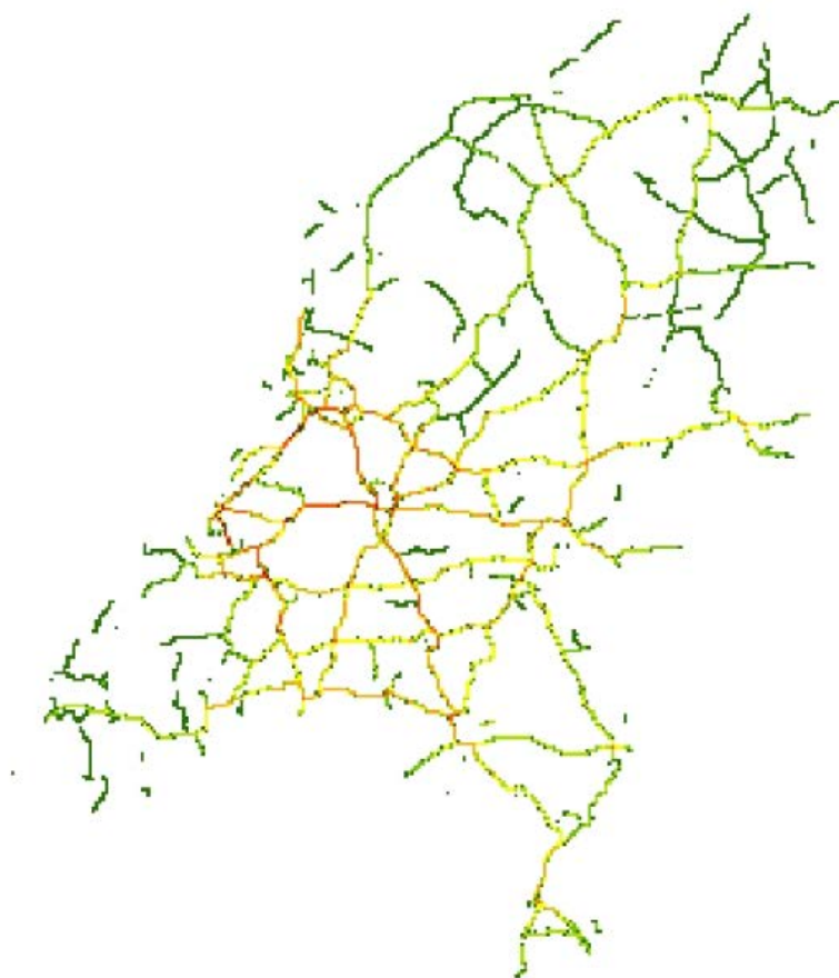
Example map 27a: Vehicle kilometres roads maximum speed \geq 100 km/h, passenger cars and delivery vans