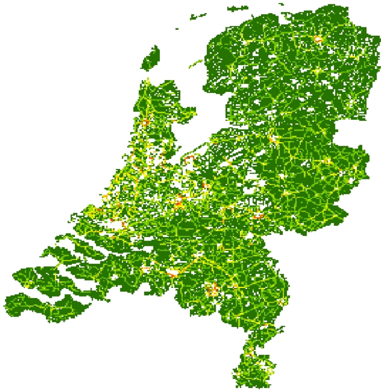
Example map 27b: Vehicle kilometres roads with maximum speed \geq 60 km/h and < 100 km/h , passenger cars and delivery vans